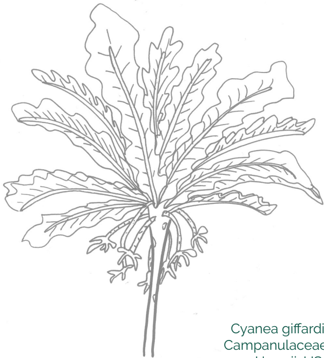
Cyanea giffardii, Campanulaceae, Hawaii, USA

Colouring is a good way of relaxing and improving our focus, have a go!